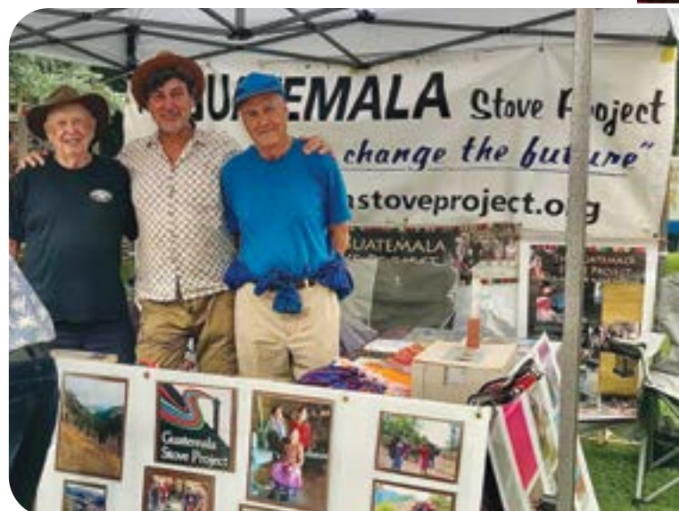
GSP info booth volunteers at Stewart Park Festival, Perth