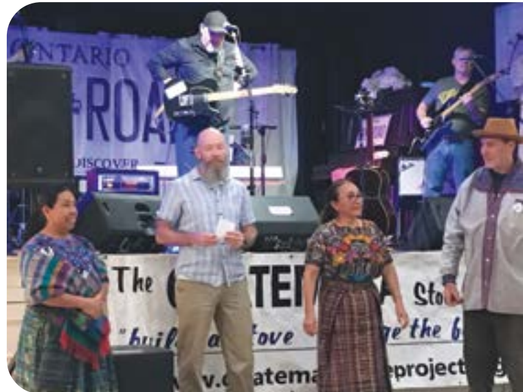
A successful Perth Fall dance with AMI guests