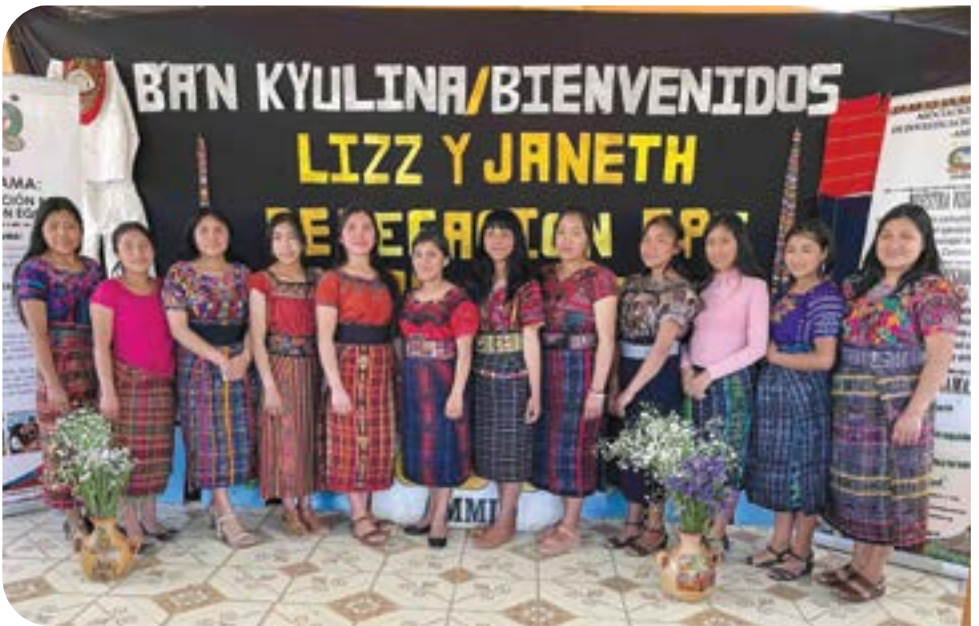
The 2025 Bursary students

Since 2014, the GSP has supported the education of Maya girls by providing bursaries to help girls attend middle and high schools. Without this support many girls could not hope to access this level of education due to limited family resources. A yearly bursary costs approximately $650 CAN for middle school and $750 CAN for high school.