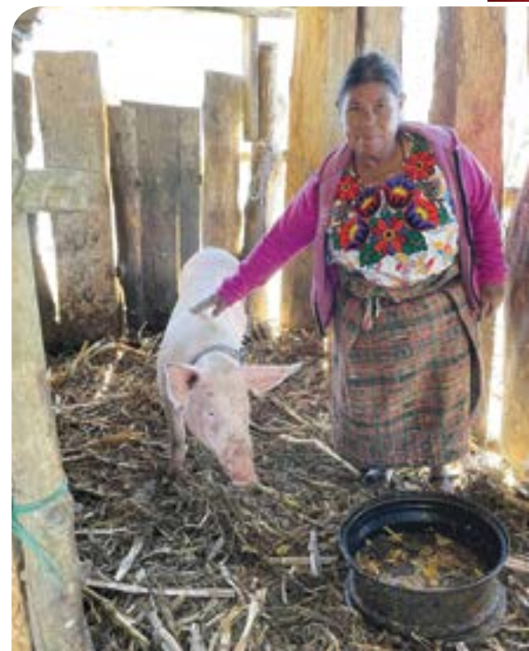
A Mayan woman with the pig she purchased using a GSP funded microloan

Since 2012, the GSP has contributed almost $40,000 ($39,907) to the AMMID “Creditos Verdes” program with $3,907 CAN added to the reserve this year. These loans help recipients achieve some degree of economic security. Examples include using a small loan to buy livestock including chickens, pigs, and sheep and/or start small business ventures. AMMID staff provide support and training. The interest rate on the micro-loan is reduced when green initiatives are carried out such as soil conservation, or reforestation. When loans are repaid, these funds are once again available for new loans which means money donated to microloans continue to help families over and over again.