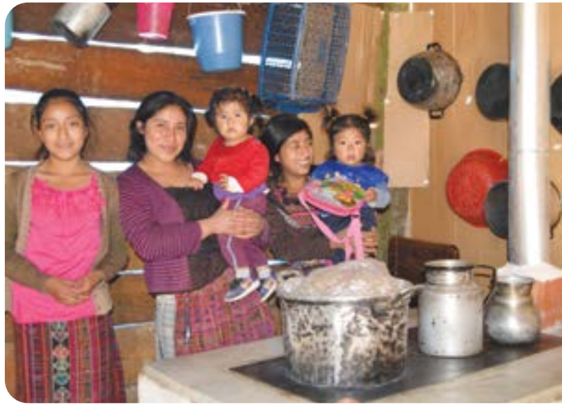
Cooking up a storm on a GSP funded family masonry cookstove

We advertise that family cookstoves cost $350 CAN to construct and the larger school stoves cost $600 CAN . However, in the past year higher costs of exchanging Canadian dollars to US dollars – a necessity when we transfer funds to Guatemala – does mean that the actual cost of building a stove over the past year is slightly higher than the $350 and $600 advertised costs.