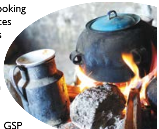
The traditional three stone fire

Working with our 3 partners – AMI, AMMID and CEDEC – the GSP sends funds as available throughout the year and local masons build cookstoves which burn cleanly and efficiently while safely venting the smoke and toxic fumes from the home. This greatly improves health for the entire family and World Health Organization studies show it extends lifespan by up to 15 years.