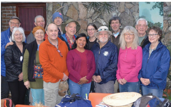
February 2023 Stove Building Trip volunteers